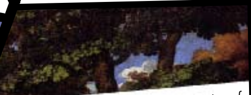
(featuring snippets of the painting The Meeting of Bacchus and Ariadne by Titian)